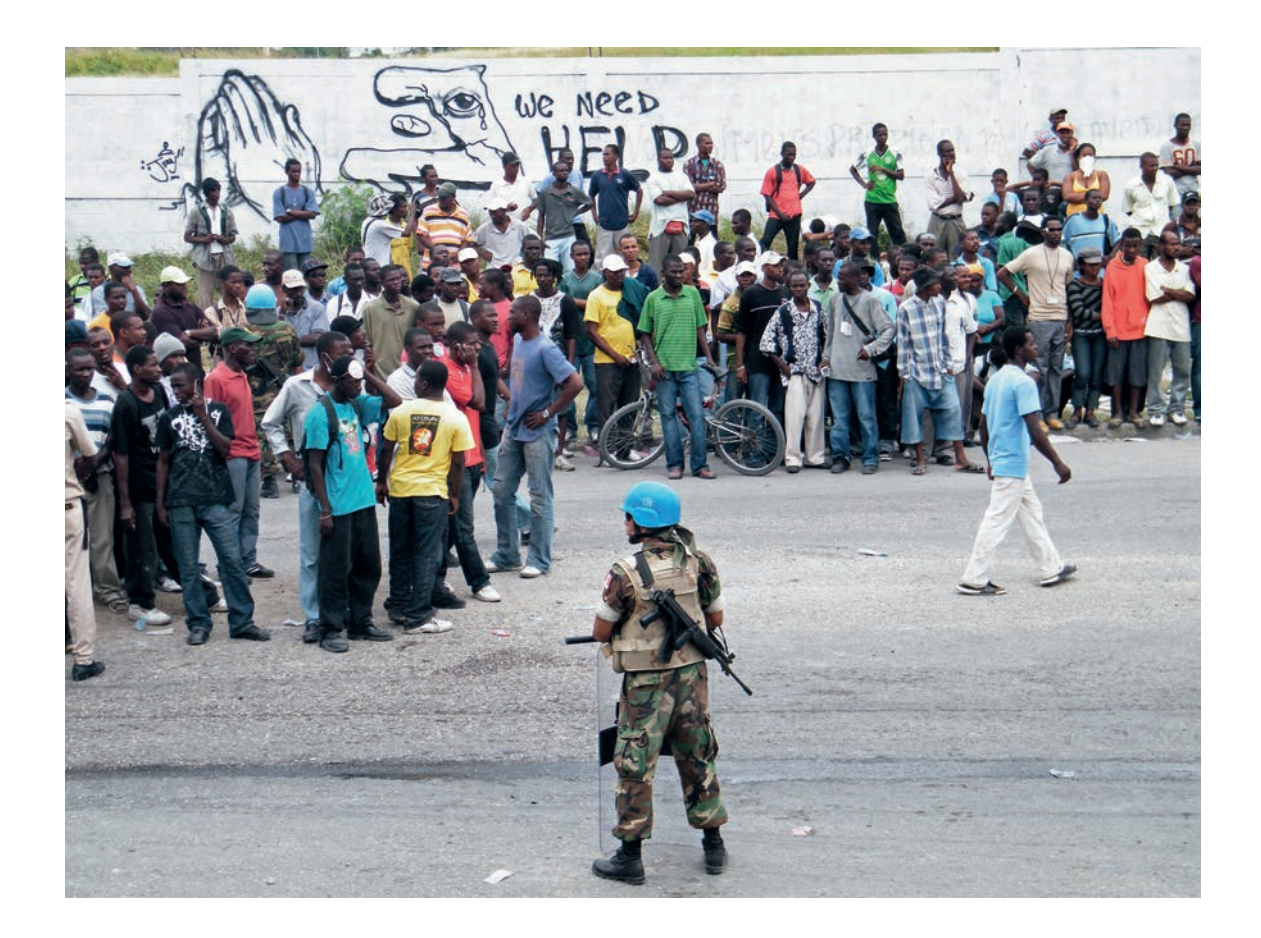
Fig. 5 – A United Nations peacekeeper watches over Haitians at an aid centre after an earthquake, January 2010